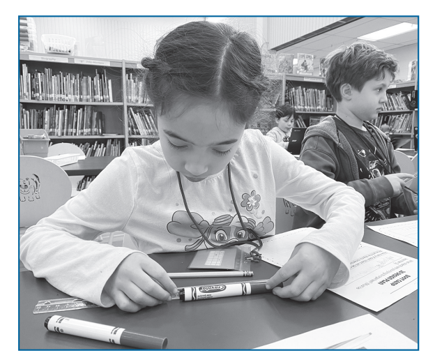
Our Mission: Engage students to continuously learn, question, define and solve problems through critical and creative thinking.

For more information on the 2024-2025 proposed budget, please visit the district website at